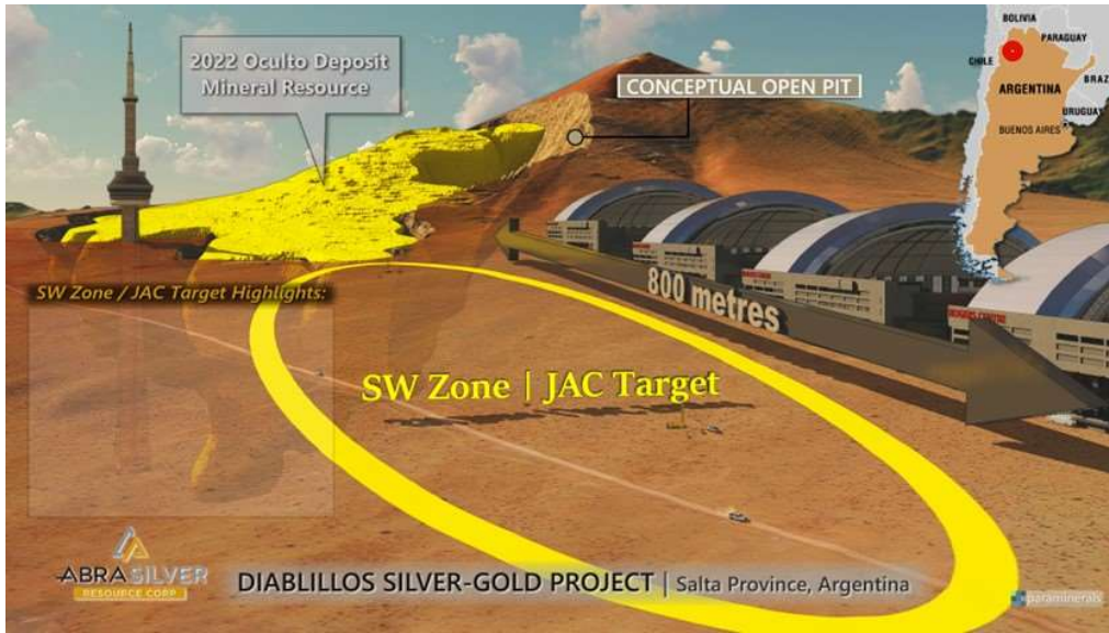
Figure 3 – 3D Representation of Large-Scale JAC Target