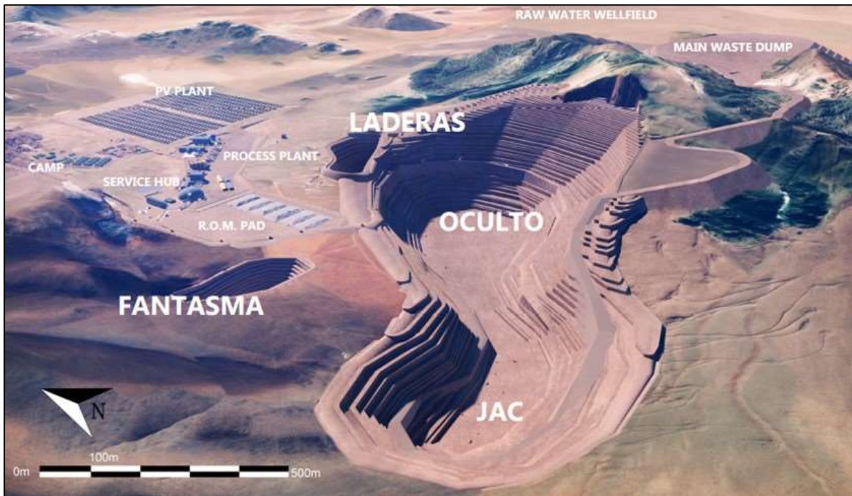
Figure 1 – View of Conceptual Open Pits and Proposed Site Infrastructure at Diablillos